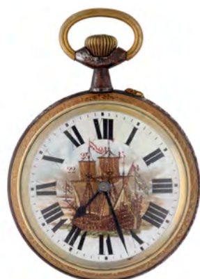
2121 Two gunmetal watches with white dials and bold numerals, 1) with seconds index and a polychrome decor depicting a village with windmill in the centre. 2) with red hour indication 13-24 and a polychrome centre decoration depicting a battleship with barracks. Both with steel dust cap and crown winding. Switzerland, around 1910. Diam. 65 - 67 mm. Total weight 202 - 205 g.