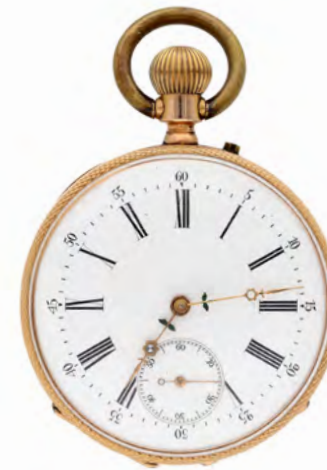
2085 An 18-kt gold watch by Pateche. Switzerland, Geneva, around 1890. Added an 18-kt gold anchor watch with bi-metal balance and compensation screws. Around 1890. Added an 18-kt gold watch with anchor movement, key winder and 15 rubies. Numbered 13800. Around 1880. Diam. 46 - 47 mm. Total weight 213 g.