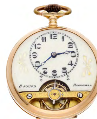
2143 A 14-kt gold 8-Days Hebdomas watch. Around 1920. With crown winding and visible balance. Numbered 30341. Diam. 46 mm. Total weight 79 g.