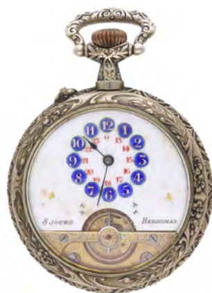
2139 An unsigned gunmetal 8-days watch. Switzerland, around 1920. The dial with royal blue numerals and black hands. The back of the watch depicting King Albert I (1875 - 1934). With visible compensated balance and crown winding. Diam. 53 mm. Total weight 110 g.