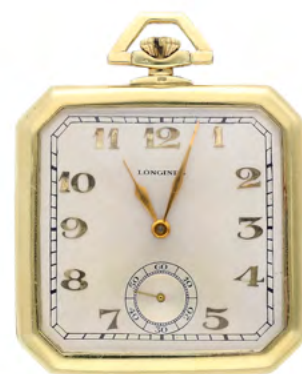
2020 A square 14-kt gold watch by Longines. Switzerland, around 1920. With silver dial and crown winding. H. 42 mm. W. 42 mm. Total weight 57 g.