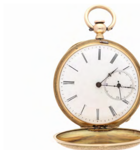
2031 A hunter cased gold ladies watch by Rossel, Geneva. Switzerland, 19th century. The watch is signed Rossel, Geneva on the gold dust cap. Patent lever and fully ruby jeweled. Numbered 54088. The case is decorated with an enamelled ladies portret. With hair woven gilt chatelaine. Diam. 41 mm. Total weight 46 g. (excl. chain)