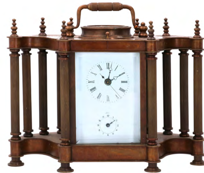
2160 A brass travel clock. France, around 1900. W. 22 cm. H. 17 cm.