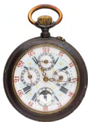
2016 A gunmetal calendar watch with indication of days of the week, days of the month, months and moon phase. Around 1900. Diam. 53 mm. Total weight 102 g.