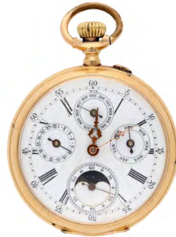
2081 An unsigned 18-kt gold astronomical watch. Switzerland, around 1920. The dial indicates the days of the week, the months, the moon phase and seconds. With bi-metal balance, compensation screws and 16 rubies. The gold dust cap is numbered 57568. Diam. 48 mm. Total weight 78 g.