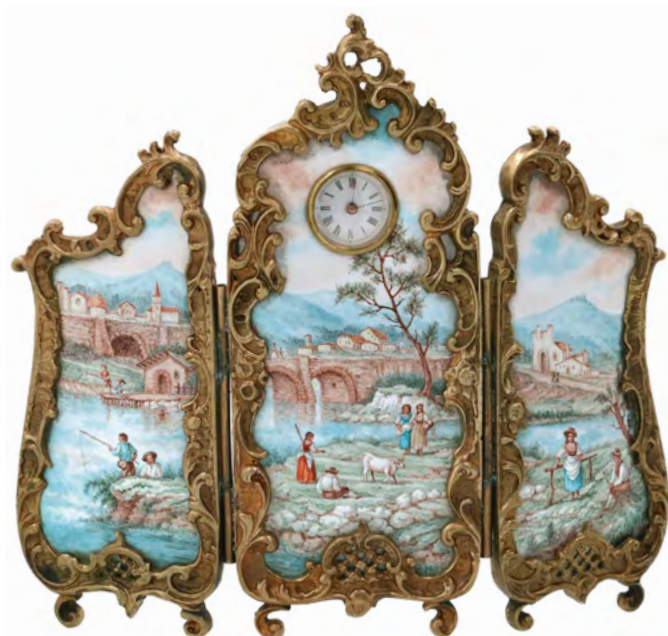
2150 A gilt copper and enamel triptych with a clock, decorated with a bridge and figures at the river side. With key. Austria, around 1880. H. 16 cm. W. 18 cm.