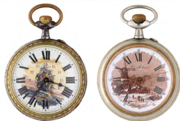
2015 Two large gunmetal watches, 1) with seconds index, regulator and sepia decor, depicting a winter landscape with windmill in the centre. Numbered 202. 2) with bold Roman and red Arabic numerals 13-24, decorated with a polychrome centre decoration depicting a frigate at sea. Both with steel dust cap and crown winding. Switzerland, around 1910. Diam. 71 mm. Total weight 194 - 195 g.