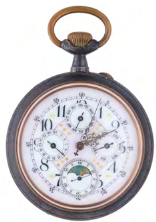
2017 A gunmetal calendar watch with indication of days of the week, days of the month, months and moon phase. Switzerland, around 1900. Diam. 66 mm. Total weight 199 g.