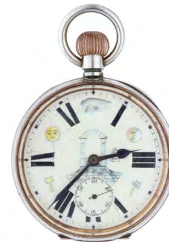
2087 A masonic gunmetal watch. Switzerland, around 1890. The enamelled dial decorated with the eye, sun, moon, axe, hammer and in the centre a temple gate. With crown winding. USA P 816321 D.R.P. 175275. Swiss patented 33103. Diam. 67 mm. Total weight 205 g.