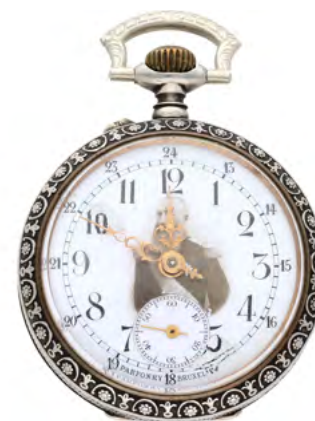
2142 A gunmetal watch with Moeri's patent. Switzerland, around 1900. The enamel dial depicting King Leopold of Belgium. The back with lions emblem with banners, crowned. Movement numbered 2547/87, non magnetic. The dust cap signed E. Parfonry, 58 rue de Namur, Bruxelles. Concours Prix de Tier, 1904. Diam. 50 mm. Total weight 103 g.