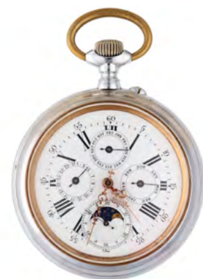
2018 A chromed metal calendar watch indicating days of the week, days of the month, months and moon phase. Around 1900. With glass dust cap. Diam. 68 mm. Total weight 229 g.