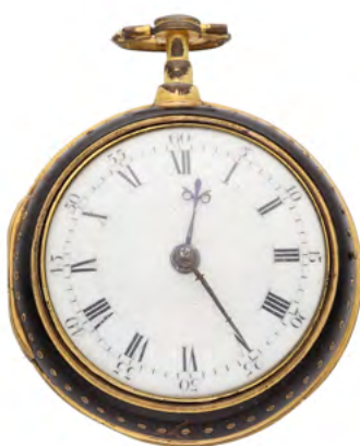
2141 An underhorn painted pair cased gilt metal watch by Jullion Brentford. England, 19th century. The verge watch has cylindrical pillars, a pierced bridge and bluesteeled beetle and poker hands. The top plate is signed Jullion Brentford. Numbered 2994. The outer case with two watch papers, of which one with text 'Love and Innocence'. Diam. outer case 51 mm. Total weight 93 g.