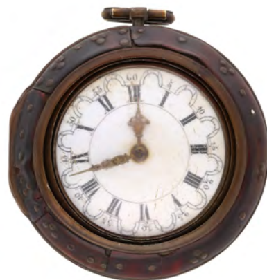
2083 A tortoise triple cased silver watch by Work. London, late 18th century. The verge watch of continental origin has square Egyptian pillars, a pierced continental bridge and is signed Work, London. Numbered 4477. London hallmarked and with case maker initials S.P. The outer case of tortoise shell is early 18th century. Diam. outer case 58 mm. Total weight 132 g.