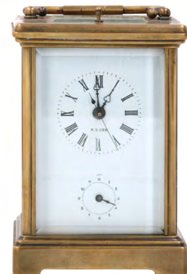
2162 A brass travel clock. Signed M.D. Ger. France, 19th century. Dim. 8.5 x 10 x 15.5 cm.