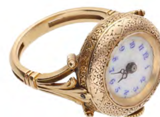
2153 A gold curio ring watch with white dial. Around 1900. Diam. 18 mm. Total weight 13 g.