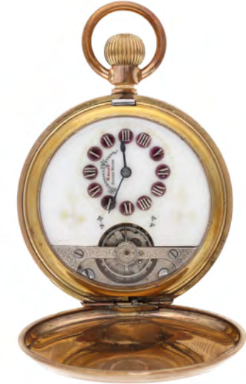
2086 An American gilt hunter cased watch, guaranteed to wear five years, eight days movement, visible balance with compensation screws. Swiss made, ca. 1890. Added a half hunter cased gilt watch by Waltham, USA. With Swiss made dial. Nine jewels. Hallmarked star Dennison trademark. English made case, around 1890. Diam. 51 - 53 mm.