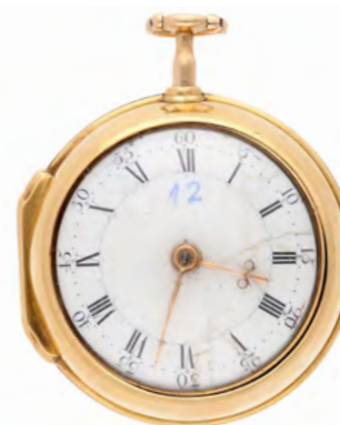
2023 A pair cased 14-kt gold watch by William Townsend. Greenock, 18th century. The watch has a pierced bridge, original gold hands and cylindrical pillars. Numbered 80. The dust cap is also signed and numbered. Diam. outer case 48 mm. Total weight 117 g.