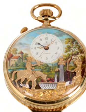
2156 A gilt musical watch by Reuge, Sainte Croix. 20th century. The top plate with 'Swiss, 17 jewels'. With automaton. With original key and box. Diam. 57 mm. Total weight 119 g.