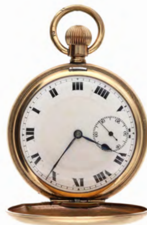
2119 A gilt hunter cased watch by Elgin. USA, around 1900. With enamelled white dial and winding at 3 position. The dust cap with indication 'Guaranteed to wear 10 years'. Numbered 4829005. Diam. 50 mm. Total weight 103 g.