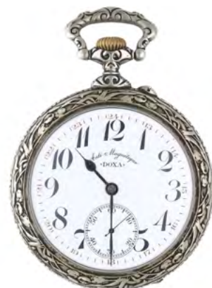
2138 A gunmetal watch by Doxa. Switzerland, around 1910. The white dial with bold Arabic numerals. The dust cap dated 1905-1906, prize winning medals in Milan and Liège. The back depicting a horseman. Diam. 70 mm. Total weight 217 g.