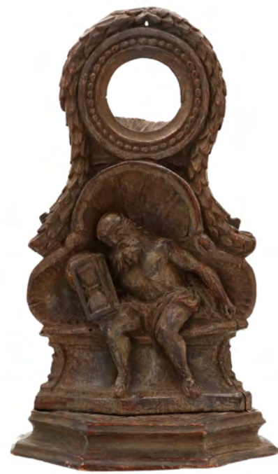
2159 A limewood watch stand depicting Father Time with a sand glass on his knee. Germany, 18th century. H. 27 cm. Diam. watch bezel 43 mm. Total weight 216 g.