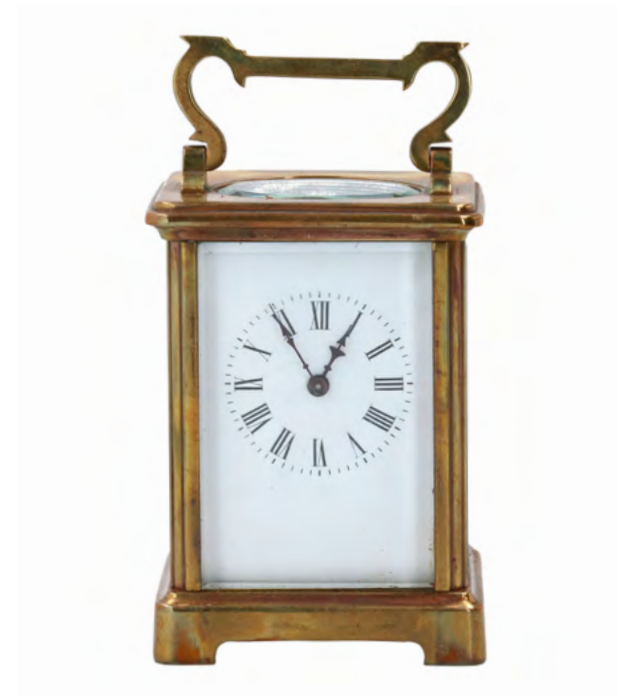
2161 A brass travel clock in case. France, 19th century. Dim. 6.5 x 8 x 12 cm.