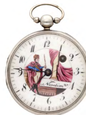
2126 An unsigned silver verge watch. France, around 1820. The white dial with front winding, depicting emperor Napoleon I. With Breguet hands. Numbered 23671. With key. Diam. 46 mm. Total weight 69 g.