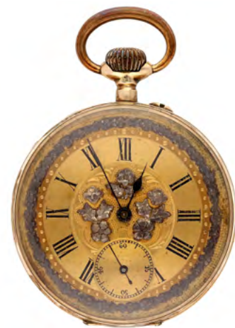
2082 An unsigned 14-kt gold cylinder watch. Early 20th century. The case inscribed with '16 September 1878-1903'. With crown winding. Diam. 44 mm. Total weight 65 g.