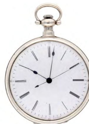
2019 An open face silver duplex watch for the Chinese market. Switzerland, around 1850. The white dial has a centre seconds hand, spade hands and engraved bridges. The movement has a silver dust cap. Marked with Chinese characters. Probably Fleurier. Diam. 62 mm. Total weight 130 g.