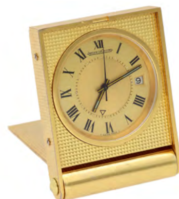
2120 A gilt carriage clock by Jaeger Le Coultre. 20th century. Numbered 1308618. H. 39 mm. W. 52 mm. Total weight 100 g.