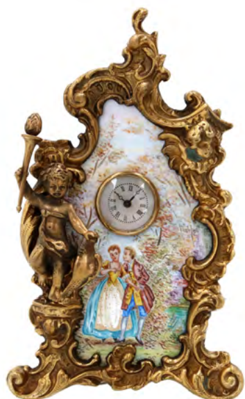
2149 A gilt copper and enamel desk clock, decorated with putti and a romantic scene. With key. Austria, around 1880. H. 11.5 cm. W. 7 cm.