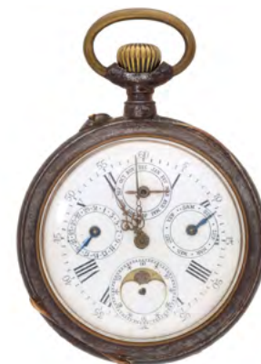
2123 An astronomical gunmetal calendar watch indicating the days of the week, days of the month, months and moon phase. Switzerland, around 1890. With crown winding and bi-metal balance with compensating screws. Numbered 199166. Diam. 51 mm. Total weight 110 g.