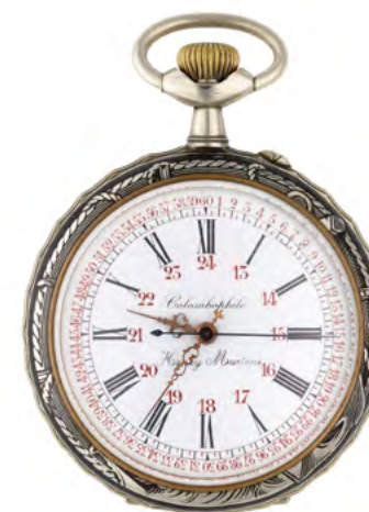
2146 A niello silver watch for pigeon racing. Switzerland, around 1930. The white dial with centre seconds 1-60. Signed Colombophile, Henry Martens. The back depicting a sinking ship, an anchor (hope) and a rescue boat. Diam. 67 mm. Total weight 188 g.