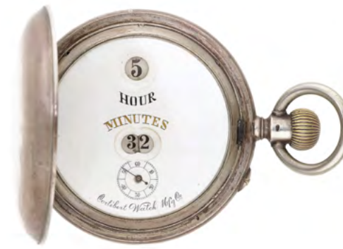
2084 A silver hunter cased digital watch by Cortébert Watch Mfg Co. Switzerland, around 1880. The upper window on the white dial showing the hours, the lower window showing the minutes. Signed 'Cortébert Watch Mfg co'. With crown winding. The silver dust cap hallmarked 800M. The top plate signed 'Cortébert watch co. pall's patent brevete SGD G'. Numbered MO1066. Diam. 54 mm. Total weight 120 g.