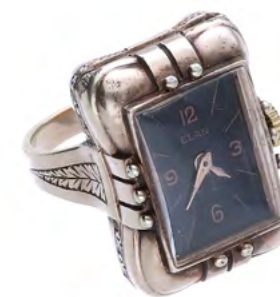
2125 A rectangular curio gilt ring watch with black dial by Elan. 20th century. H. 24 mm. W. 18 mm. Total weight 14 g.