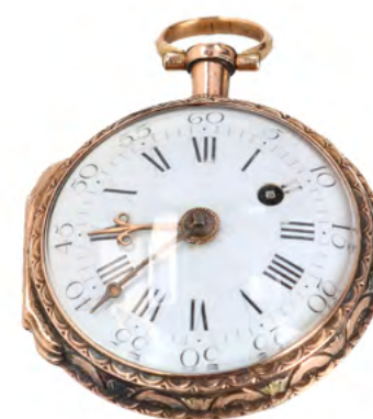
2152 An unsigned multicoloured gold ladies watch with front winding. France, late 18th century. Diam. 37 mm. Total weight 44 g.