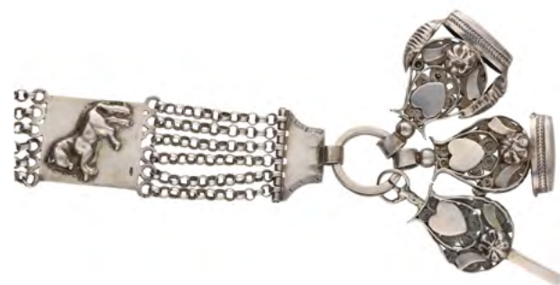
2028 A silver pair cased watch by N. Sudderfield, London. With pierced bridge, gold hands and original bull's eye glass. Numbered 917. Hallmarked Birmingham, 1858. With a Dutch silver chain with signets. Diam. outer case 59 mm. Total weight 213 g.