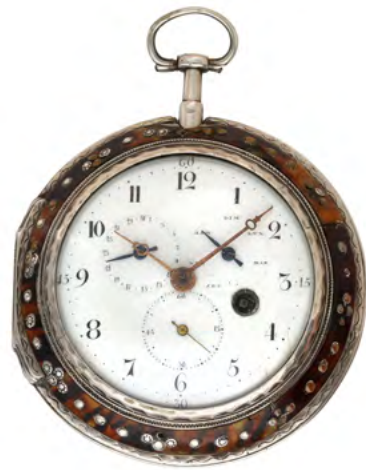
2079 An 18-kt gold hunter cased watch by Le Phare. Switzerland, around 1910. With quarter repetition mechanism and chronograph. Diam. 51 mm. Total weight 89 g.