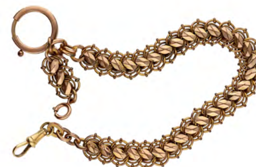
2124 A set of three watches, 1) a 14-kt gold watch, numbered 168588, système Glashütte, circa 1920. 2) an 18-kt gold watch, numbered 2376, sold by B. Lovens, Brussels. Monogrammed JHC. Around 1920. 3) a gold watch by NH Watch Company with gilt chain. Around 1920. Diam. 47 - 54 mm. Weight chain 27.5 g.