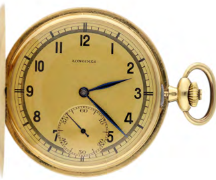
2080 An 18-kt gold hunter cased watch by Longines. Around 1930. With metal dust cap. Numbered 5423325. Diam. 46 mm. Total weight 68 g.