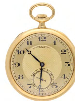
2144 An 18-kt gold watch by Vacheron Constantin. Geneva, 20th century. The dust cap with inscription 'Mn. J.M.J. van Wielik, la Haye.' Numbered 390047. Diam. 49 mm. Total weight 78 g.