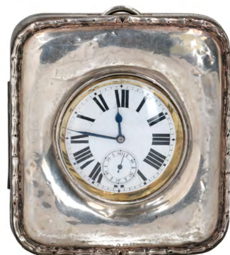
2151 An unsigned gunmetal anchor watch. Switzerland, around 1910. The white dial with bold Roman numerals. With glass and metal dust caps. Numbered 5583. In original silver and leather watch case. Diam. 66 mm. Total weight 200 g.