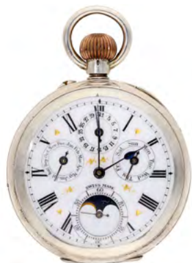
2026 A second grade silver astronomical calendar watch indicating the days of the week, days of the month, months, moon phase and seconds index. Switzerland, around 1890. With crown winding. Numbered 2915. Diam. 50 mm. Total weight 98 g.