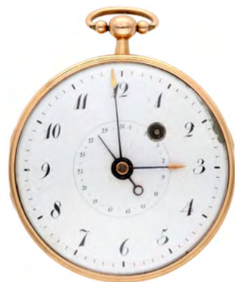
2147 An unsigned 18-kt gold calendar watch. France, around 1820. The dial with date indication and front winding. With gold dust cap. Diam. 54 mm. Total weight 110 g.