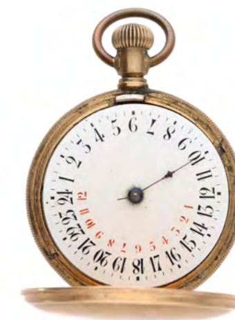
2154 A gold hunter cased 24-hour dial pocket watch. America, around 1890. With crown winding. Signed New York, Standard Watch. Numbered 956389. Diam. 54 mm. Total weight 111 g.