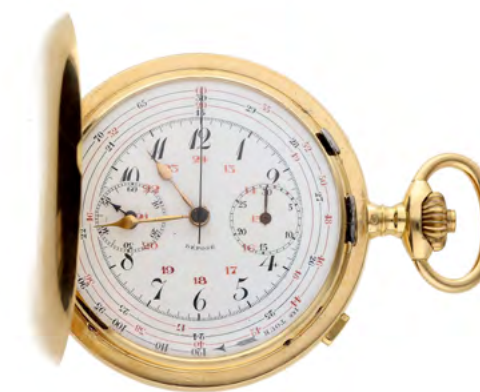
2145 An unsigned hunter cased 18-kt gold watch. Around 1920. With 30-minute chronograph and crown winding. Numbered 37763. Diam. 50 mm. Total weight 102 g.