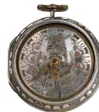
2155 A pair cased watch by Cabrier. London, 18th century. This verge watch has square pillars, gilt brass pierced hands and a pierced continental bridge. Signed Chs Cabrier, London. With silver champlé dial with date indication. The glass with bull's eye. The outer case is decorated with a portret of a nobleman. With key. Diam. outer case 54 mm. Total weight 114 g.