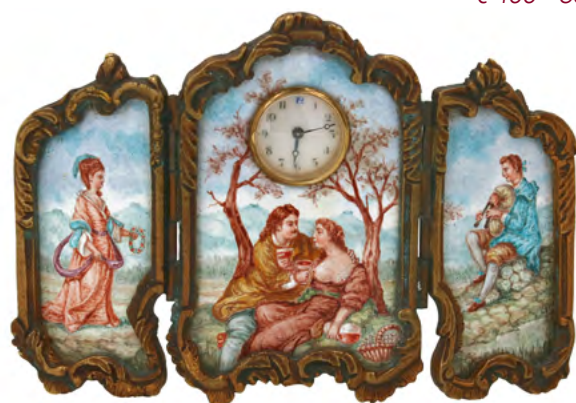
2148 A gilt copper and enamel triptych with a clock, decorated with a romantic scene. With keys, in case. Austria, around 1880. H. 7.5 cm. W. 11.5 cm.