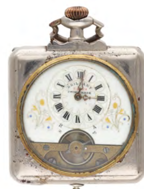
2140 An unsigned steel 8-days brilliant watch in a square case. Switzerland, around 1890. With visible balance. Brevet numbered 33606. Case numbered 131. Diam. 53 mm. Total weight 113 g.