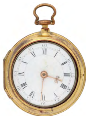
2118 A gilt metal pair cased watch by Fra.s Perigal, London. England, 18th century. The watch has a white dial and gold hands. With typically English bridge and a key. Numbered 351. Diam. outer case 47 mm. Total weight 90 g.