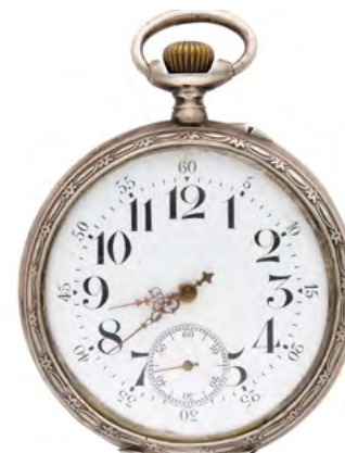
2030 An unsigned third grade silver railway watch. Switzerland, around 1910. The white dial with bold Arabic numerals. The movement with '15 rubies, anti magnetic'. The back depicting a steam train. The dust cap with prize winning medals. Thun, 1899. Numbered 39424. Diam. 61 mm. Total weight 129 g.