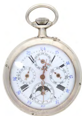
2027 A second grade silver cylinder astronomical calendar watch indicating the days of the week, days of the month, months, moon phase and seconds index. Switzerland, around 1910. The movement with 8 rubies. With crown winding. Diam. 50 mm. Total weight 90 g.