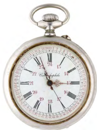
2137 A gunmetal watch for pigeon racing. Switzerland, around 1920. The white dial with centre seconds 1-60 and crown winding. Signed Colombophile. In original wooden case, signed 'Gabriel de Lille, Maldegem. Verhuring en verkoop van constateurs'. Diam. 65 mm. Total weight 171 g.