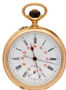
2025 A 14-kt gold chronograph watch with centre seconds. France, 1892. Signed and dated C.A. Gondy a Besançon, 1892. With 20 rubies. The case is monogrammed IC. Diam. 52 mm. Total weight 105 g.