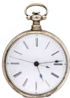
2024 An open face silver duplex watch for the Chinese market. Switzerland, around 1850. The white dial has a centre seconds hand, spade hands and engraved bridges. The movement has a glass dust cap. Marked with Chinese characters. Numbered 6090. With case maker initials LEB. Diam. 55 mm. Total weight 99 g.