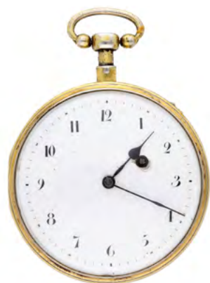
2013 An unsigned gilt silver watch. France, around 1820. With quarter repetition mechanism, front winding and key. Numbered 2084, T13. Diam. 55 mm. Total weight 135 g.