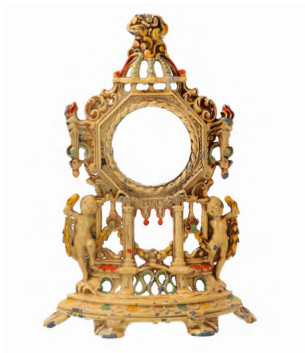
2157 A cast iron polychrome painted watch stand, crowned with flowers, torches on the side and cherubs supported by pillars. Germany, around 1850. H. 35.5 cm.