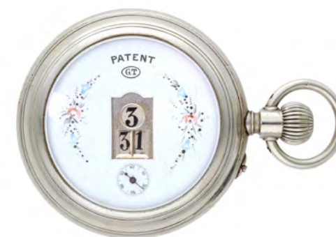
2021 A digital gunmetal watch. Switzerland, around 1890. With an enameled dial with floral decor and 'Patent GT'. With crown winding and a metal dust cap. Numbered 309669. Diam. 51 mm. Total weight 122 g.